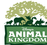
Killimanjaro Safaris at Disney's Animal Kingdom Theme Park

Filled with fun, thrills and untamed adventures this unusual theme park is a marvel of animals, real, imaginary and extinct. Take a suspense thrill ride to rescue the last dinosaur on earth, travel through the savannahs on Killimanjaro Safaris or stroll through the jungle to meet a troop of gorillas.