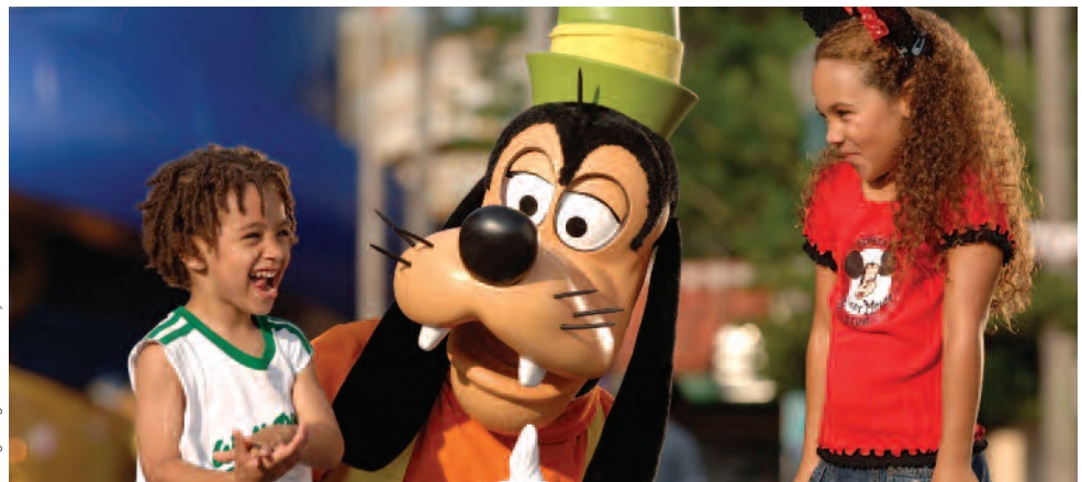
© Magic Kingdom Park © Disney