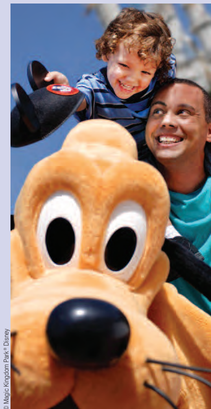
© Magic Kingdom Park © Disney