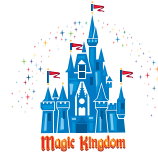
Guests at Cinderella Castle in Magic Kingdom Park

Home to all your favourite Disney characters, Cinderella Castle, seven themed lands and over 40 attractions, Magic Kingdom Park provides fun, fantasy and magic for the young and young at heart. From the very first step onto Main Street, USA to speeding through the stars at Space Mountain, to the mayhem of Stitch's Great Escape!