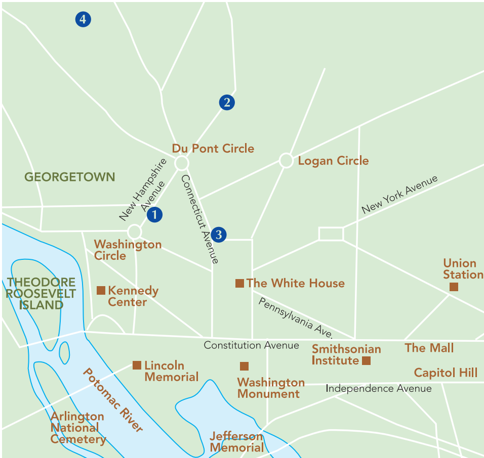
Hotel locations are indications only. Not to scale.

In addition to its famous monuments and museums Washington has attractive neighbourhoods, such as Dupont Circle , Georgetown and Adams Morgans each offering excellent restaurants and shops. There is also plenty going on in the evenings.